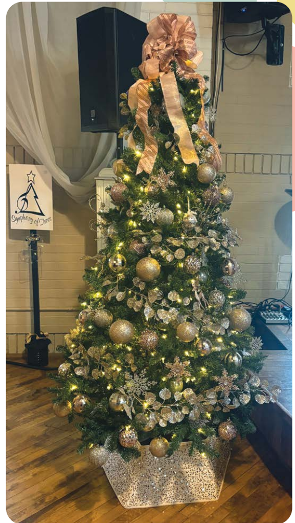
The Napoleon Campus entry created for the annual Symphony of Trees is resplendent with silver, bronze and rose gold decorations.