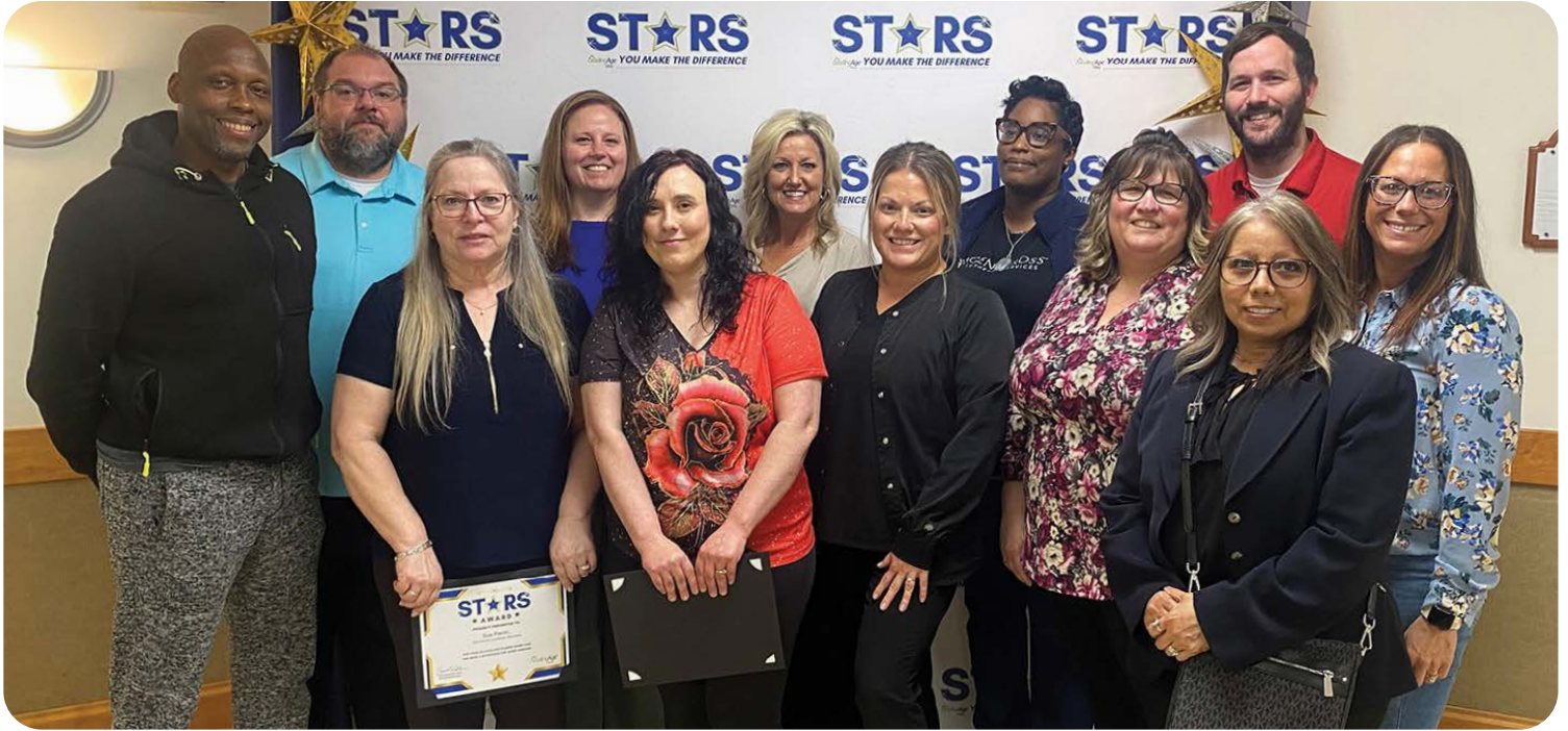
Numerous Genacross STARS award winners attended the LeadingAge Ohio Northwest Region luncheon with other Genacross leadership and team members.