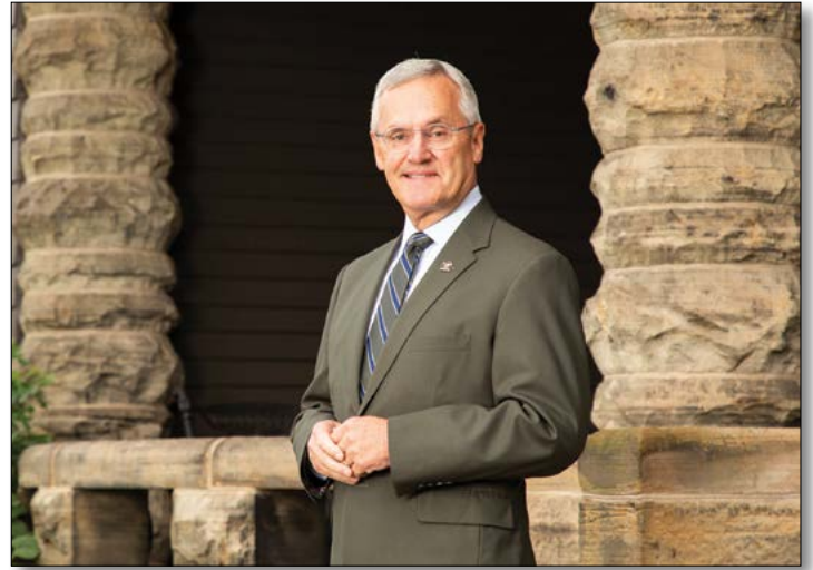
Former Ohio State coach Jim Tressel will be speaking on leadership, motivation and philanthropy.