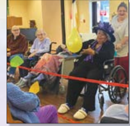
Wolf Creek residents have fun playing balloon volleyball using flyswatters.