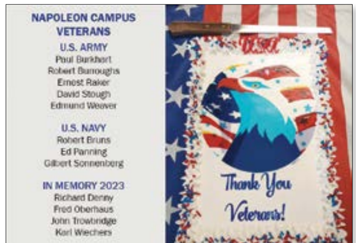
The patriotically decorated cake was a delicious part of the luncheon held to thank veterans.