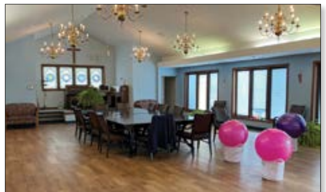
The former chapel at the Sandusky Campus is now used for activities.