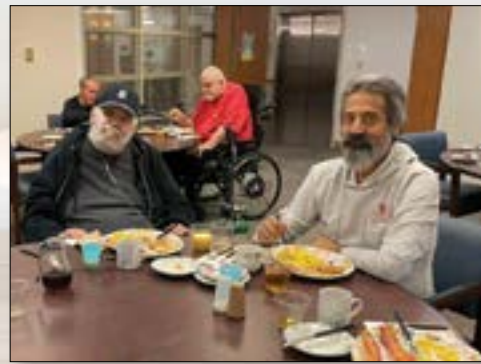
The monthly men's breakfast at the Wolf Creek Campus is a place for good food and fellowship.