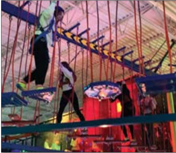
Youth in care navigate the ropes course at Urban Air during a fun sponsored event.

The trampolines, zip line, slides, climbing wall and ball pit obstacle courses were hits as well. Youth also spent time jumping while shooting basketballs and playing dodgeball in the netted area.