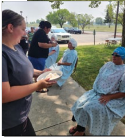
Napoleon Campus team members line up for a balloon toss (top) and managers (left) are ready to get a pie in the face.