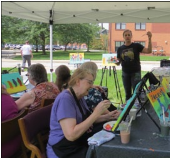
A free painting class for seniors was held on the Wolf Creek Campus lawn.