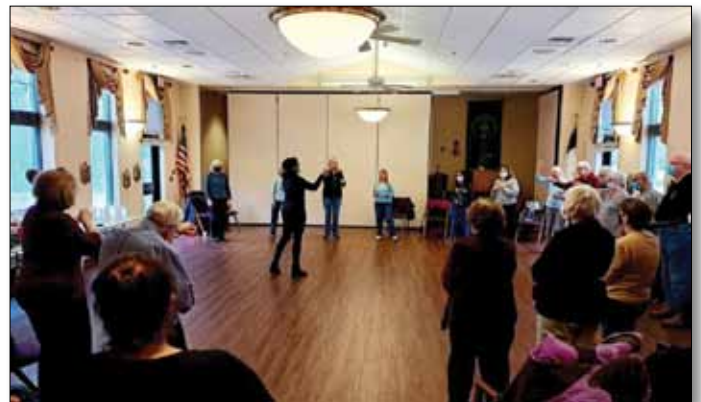
The Senior Self-Defense class held in February was so popular that another session is planned for July 13.

"The Wolf Creek Campus is so excited to bring back events, because we want to showcase our dedication to the community," she said. "They also allow us to create awareness of Genacross and how we can provide support for the local aging population."