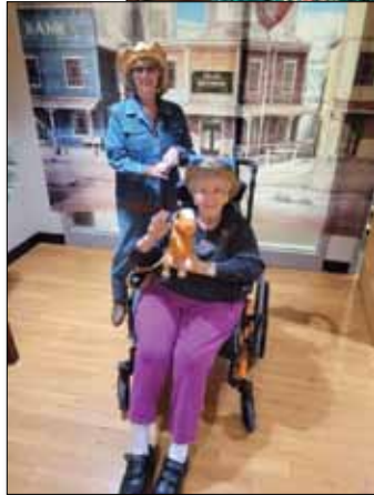
Napoleon Campus residents and staff celebrated National Skilled Nursing Care Week with themed days like Luau Day (top) and Western Day (left).

“Cultivating Kindness” was the theme for the 2023 National Skilled Nursing Care Week, held May 14-20. The Genacross Lutheran Services-Napoleon Campus embraced this week, as it is a time to celebrate the hard-working employees and the bond between residents and staff members.