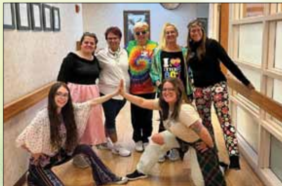
The Wolf Creek Campus kicked off National Skilled Nursing Care Week with Decade Day. Staff dressed up in the decade of their choice.