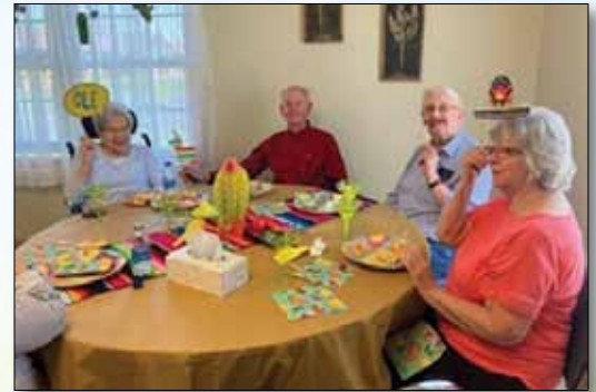
Bavarian Village residents on the Napoleon Campus celebrate Cinco de Mayo with fun props and yummy treats.