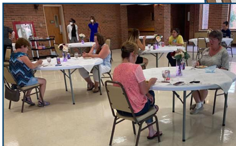
Toledo Campus staff were given a lunch to thank them for their work during the pandemic.

Johnson's Country & Ice Cream Shoppe donated ice cream flurries to staff at the Napoleon Campus.