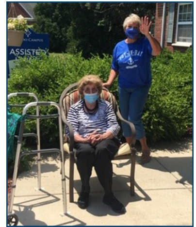
The Toledo Campus assisted living patio is a fine place for a family visit.