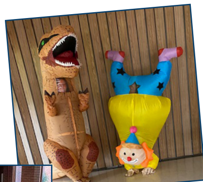
Toledo Campus Executive Director (right) clowns around with the Director of Nursing on Wacky Wednesday.