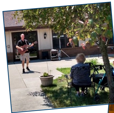
The Guitar Guy entertains Napoleon Campus assisted living residents.