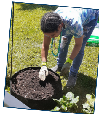
Young adults from Family & Youth Services' East Toledo Home plant gardens.