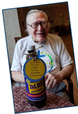
Father's Day at the Wolf Creek Campus featured Dad's Root Beer.

God is, indeed, at work, in the sharing, in the creativity, and in the laughter. He is in the continual providing of care on our care campuses and in the comfort of people's homes through our home health agency. What blessings they are, which may even lead us to join the psalmist, who began with a lament wondering where God was, in ending with words of praise, "I will sing to the Lord, because he has dealt bountifully with me." (Psalm 13:6).