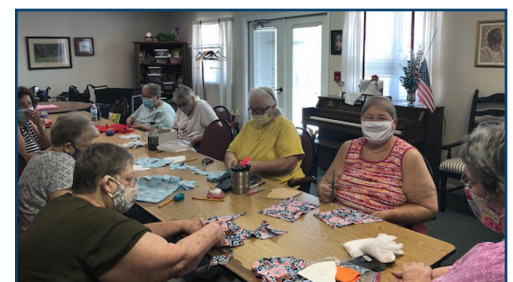
Luther Hills senior housing in Toledo received a grant for materials to make masks for Toledo Public School teachers and staff.