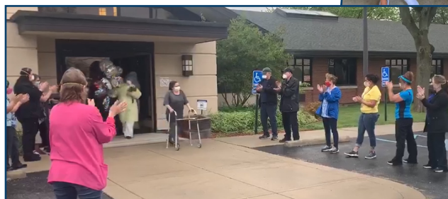
Staff from the Labuhn Center on the Toledo Campus celebrate the recovery of a COVID-19 patient.