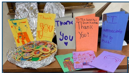
Cards and cookies from children in our Family & Youth program were delivered to the Toledo Campus.

God is, indeed, at work in our midst. He is present in the day-to-day routines of our staff, and the elderly and youth we serve. He is there in the surprises. He gives us each other and, through our relationships, He helps us, comforts us, encourages us, and assures us that we are never alone. In addition, He gives us people to serve and a purpose that through us our world and our life in it can be a blessing.