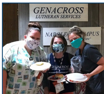
A lunch at the Napoleon Campus during National Skilled Nursing Care Week celebrates staff.

In spite of the restrictions and limitations of the COVID-19 pandemic, God has continued with us, as well, through the thoughtful sharing of so many friends, as congregations, businesses, and individuals supported Genacross with such gifts as donuts, meals, and flowers. The Wolf Creek Campus successfully completed a mask drive, receiving more than 500