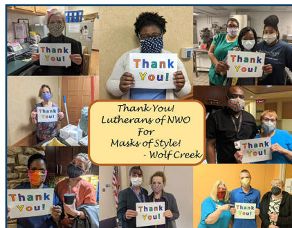
Wolf Creek’s mask drive was successful, and staff members are very thankful.