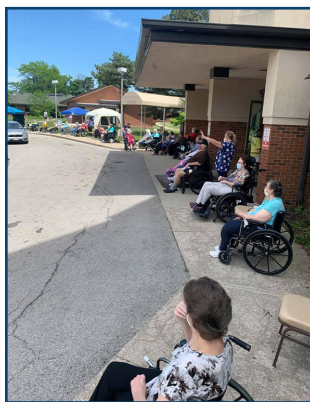
Toledo Campus residents watch a parade of their loved ones.