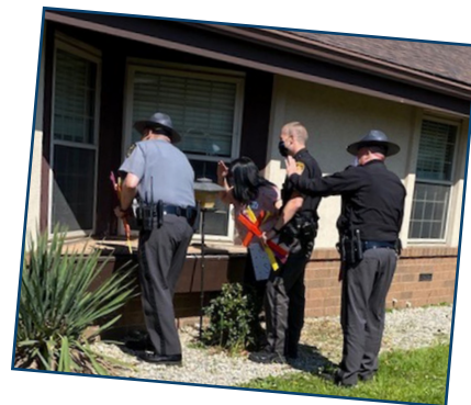
After the Parade of Lights at the Napoleon Campus, officers placed colorful crosses outside residents' windows.