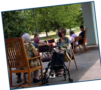
Wolf Creek Campus assisted living residents visit with family outside in the fresh air.