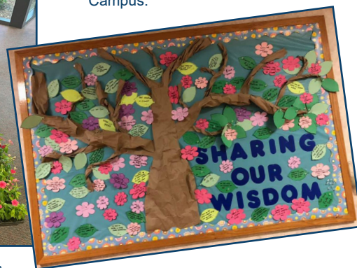
A board at the Wolf Creek Campus echoes the nursing care week theme and shares words of advice from residents and staff.