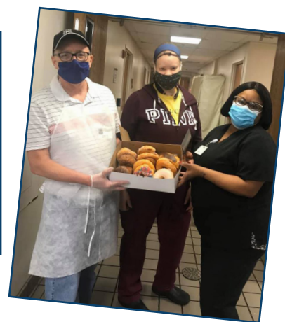
Calvary Church in Toledo dropped off donuts for staff at the Wolf Creek Campus.