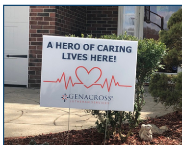
These employee yard signs show neighbors that a caring Genacross hero lives in their midst.