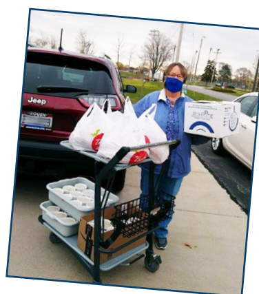
A Kozy Corners Restaurant employee delivers lunches to Covenant Harbor senior community in Oak Harbor.