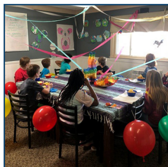
Several youth in care celebrated Cinco de Mayo by cooking food and decorating their home.

The message is clear. No matter how uncertain the future may be, we are not alone. God is at work in our midst. That may be why the same psalmist who asked God if he had forgotten him, ends his song with the words, "I will sing to the Lord, because he has dealt bountifully with me." (Psalm 13:6). We are, indeed, in this together, supporting one another. Thanks be to God!