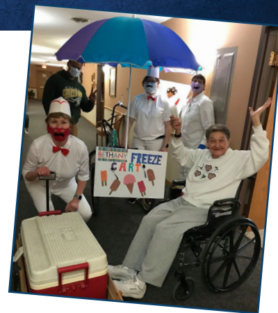
Bethany Place residents were surprised with ice cream treats from creative staff.