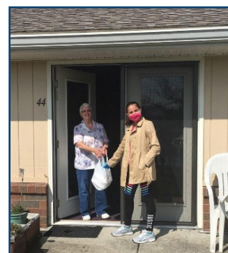
St. Peter Lutheran Church in Norwalk provides groceries and meal delivery to residents of Luther Oaks.