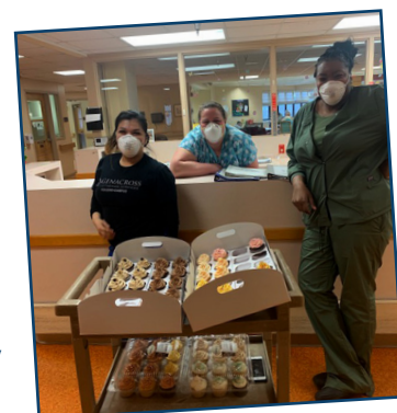
Toledo Campus staff were treated to fresh cupcakes by Scooter's Bakery.

Although pseudonyms are used in the above ministry stories, Genacross follows HIPAA guidelines and has either obtained permission from our residents, patients, or clients, or has sufficiently concealed their identities, thereby enabling us to use their stories of God's grace.