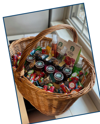
A generous family shared treats with Napoleon Campus staff.