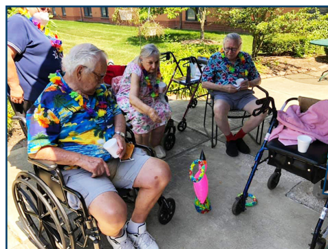
Wolf Creek Campus residents played Flamingo Ring Toss and Pineapple Bowling during Hawaiian Week.