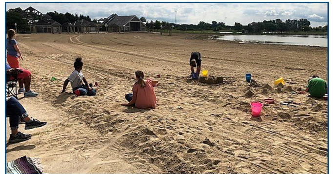
Youth from the Oregon group home are awarded a day on the beach at Maumee Bay State Park for their hard work over the summer.