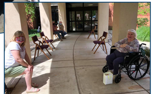
Wolf Creek nursing care residents visit outdoors with family.