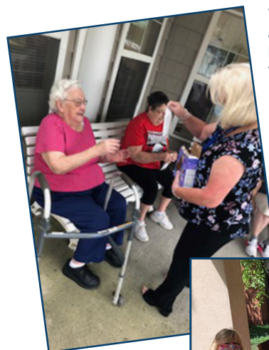
Residents at Kettle Run senior housing in Bucyrus received ice cream and a deck of playing cards from United Healthcare.