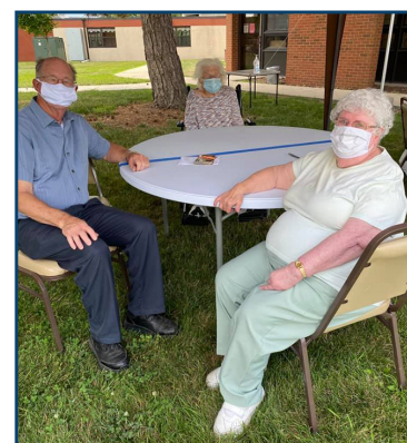
Toledo Campus nursing care residents now can enjoy outdoor visits with family members.