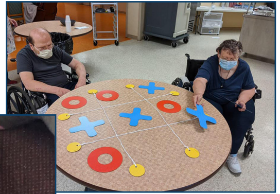
Toledo Campus residents have a tic-tac-toe game large enough to be played at a distance.

God is indeed in our midst, calling us to be His hands, giving us the opportunity to help those we serve and each other meet the challenges, heal the hurts, and get through the disappointments and frustrations that are so much a part of life. Thanks be to God!