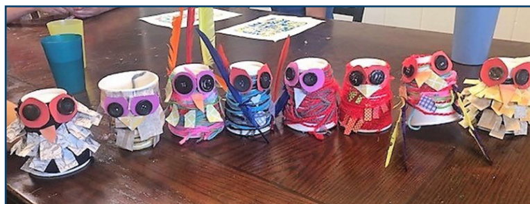
Youth at the Oregon group home made these adorable birds during Nature Week.

God was there when staff and volunteers led activities and while families visited and shared meals and brought goodies. The psalmist was right-on when he declared to God: "You show me the path of life. In your presence there is fullness of joy, in your right hand are pleasures forevermore." (Psalm 16:11). In fact, the residents