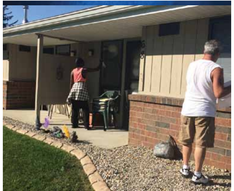
Jeep workers thoroughly cleaned windows and pulled weeds around resident patio areas.

housekeeping in some residents' apartments, and cleaned the windows inside and outside in the buildings' common areas. At Luther Hills and Luther Ridge, the volunteers baked cookies, passed them out to residents, and spent time interacting with them.