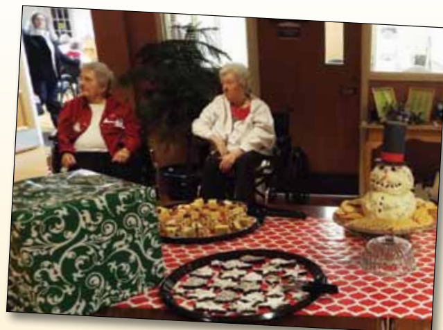
Artfully displayed refreshment stations enabled residents and guests to eat and mingle.

The next obstacle to conquer was the food. Appetizers were set up in grazing stations throughout the care center, so people could easily eat as they mingled. Guests were treated to such items as a snowman cheeseball, strawberry Santa hats, brownies in the shape of Christmas trees, and festive parfaits.