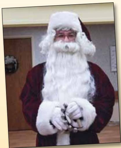
Santa handed out gifts at the Christmas Party.